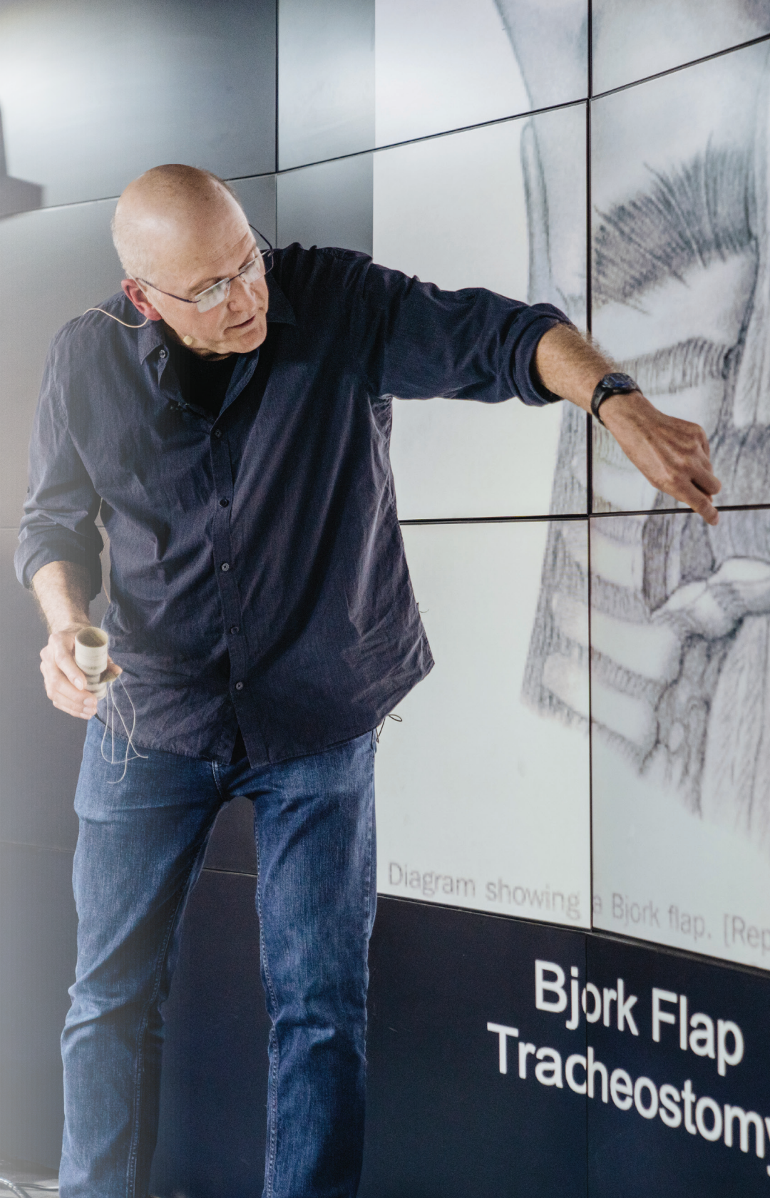
Diagram showing a Bjork flap. [Rep